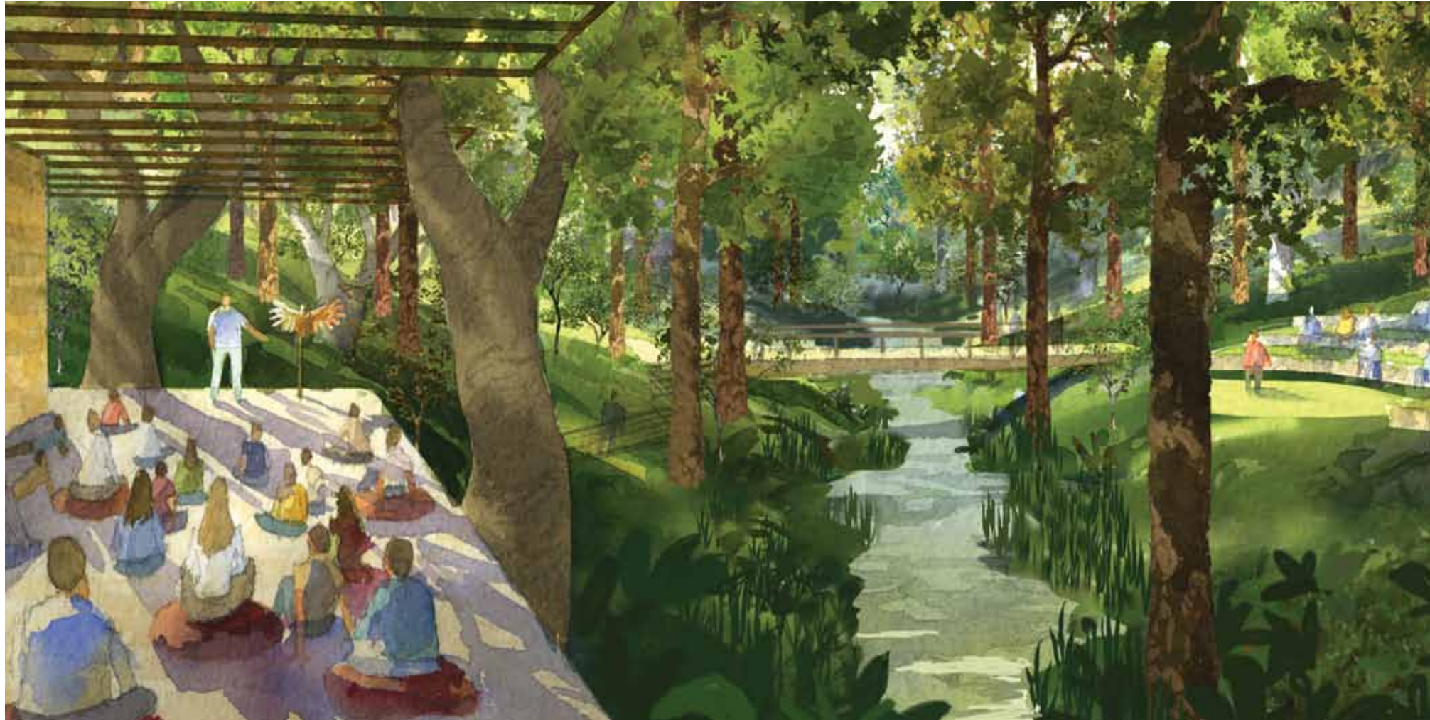
A new Outdoor Learning Center and Amphitheater will be designed with environmental sustainability in mind, and will serve as multi-disciplinary resources for all our students.

For information on the Tomorrow's Promise Campaign, go to www.kinkaid.org/tomorrowspromise .