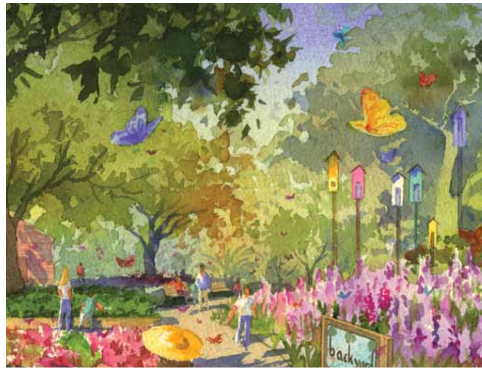
The Backyard, Kinkaid's outdoor "classroom", will be expanded to include many more learning opportunities for our students.