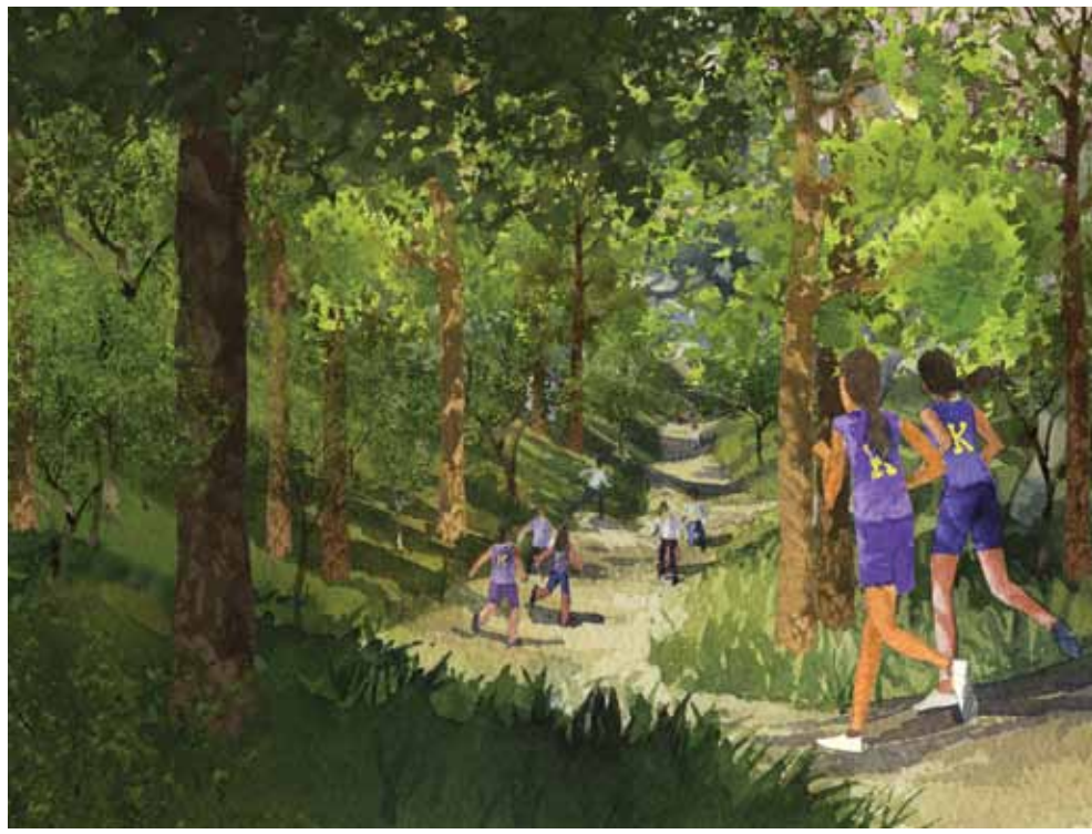
A jogging/walking trail will run throughout the property, which includes hills and other varied terrain. Kinkaid's cross-country team is already using part of the trail.