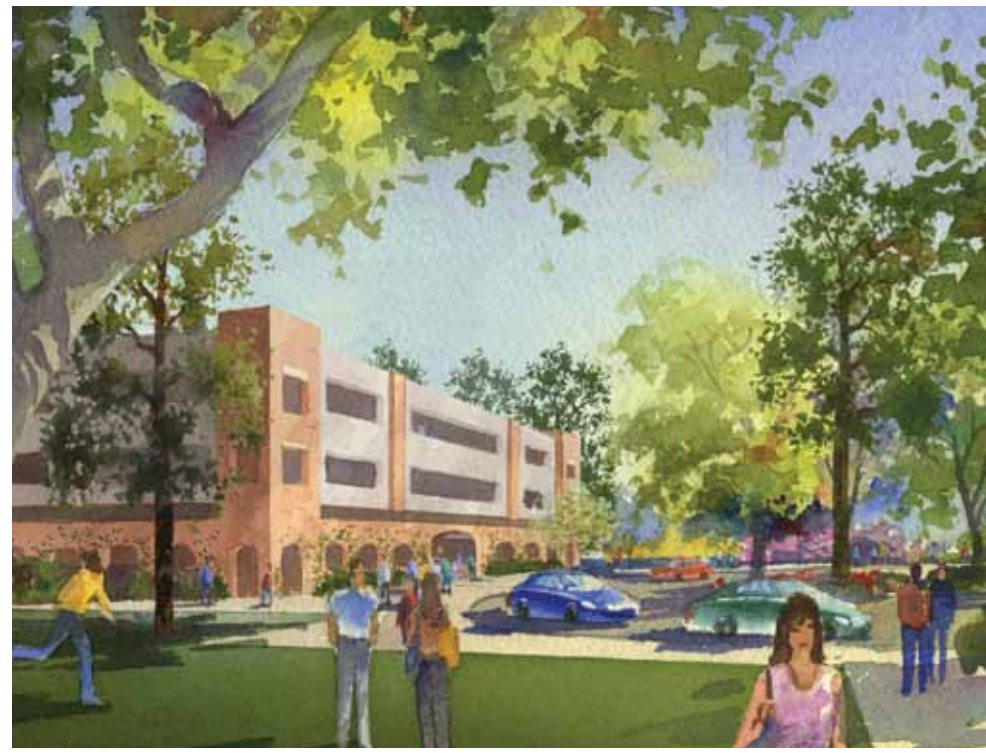
A multi-story parking garage will be built to better accommodate the cars of students, faculty and visitors to campus.